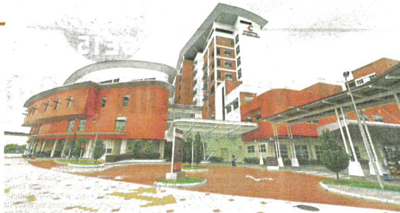
The newly-opened Cyberjaya Hospital. Up to August, Malaysia has allocated 2.59 per cent of its gross domestic product on public healthcare.

PH aims to decriminalise attempted suicide and increase mental health protection through insurance schemes. It also wants to address non-communicable diseases (NCD) and discourage